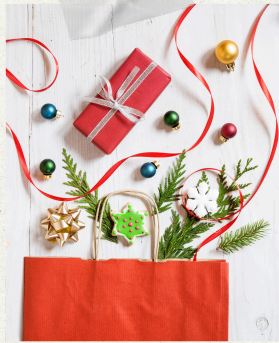
Presents & Presence