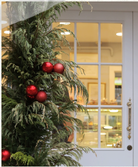
Your Holiday Survival Kit